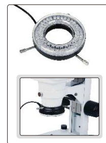
LED ring light (optional)